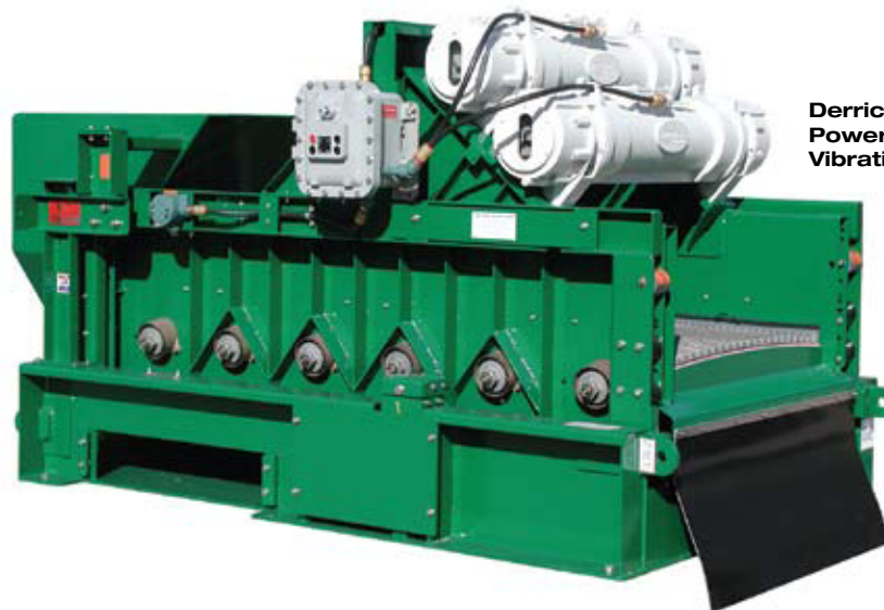
Derrick FLC 513 Powered by Super G 2 Vibrating Motors

An Integral Part of the High G Solution®