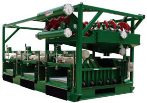
Triple FLC 503 with Optional Cone Package and Superstructures