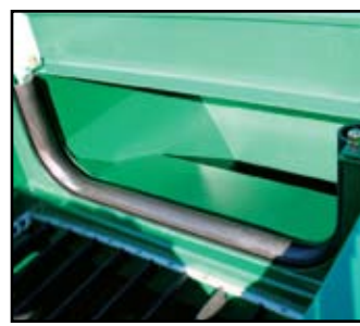
Low Weir Feed